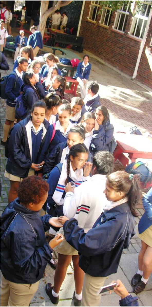
Learners lining up to get their face painted.

Bergvliet High School learners certainly got into the spirit of things on Africa Day by selling African food, painting faces using traditional African designs and making African wall hangings.