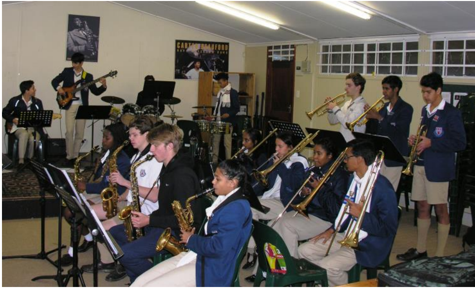
Early morning rehearsals in the Music Department for the Cape Town Big Band Jazz Festival at the Baxter.