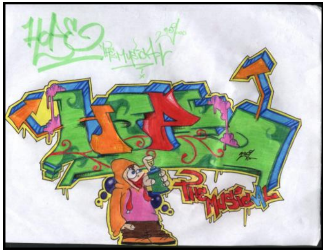
Third place went to Chad Colwell