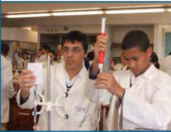
Above: Science visit to UCT