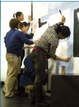
Above: Collaborative Art Work