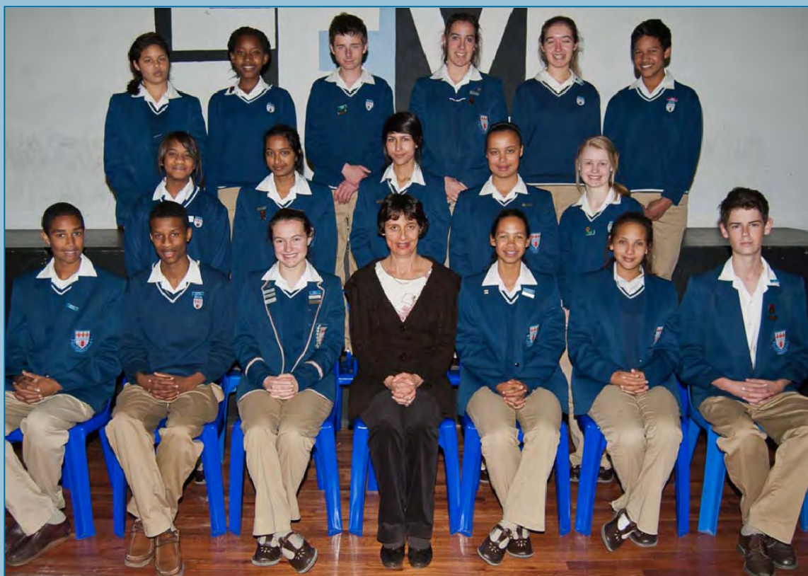
ABOVE : RCL MEMBERS (Not in order of photograph)