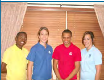
Above: 2012 House Sports' Shirts