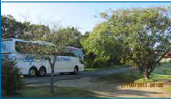
Above: Sports' Tour Bus