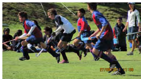
Above : The Under 14 boys in action