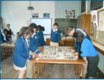
Above: Sleeping Bag Marathon